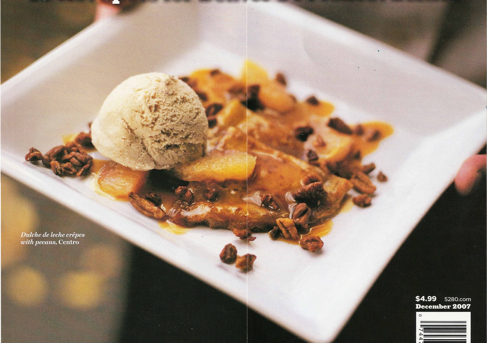
Dulche de leche crêpes with pecans, Centro

10 Hot Spots for Denver's Freshest Dishes